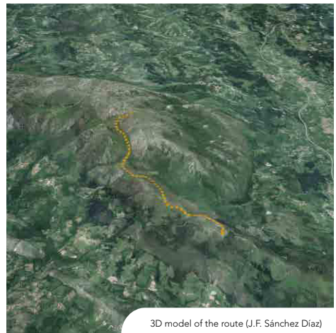
3D model of the route (J.F. Sánchez Díaz)

If we are not very loud, it might be easy to sight some fallow deer grazing and resting on the higher and clearer area of the Sierra. During the hottest time of day is harder to see them, as they tend to seek shelter in the small holly, hawthorn and ash copses, which are abundant in this area.