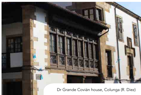
Dr Grande Covián house, Colunga (R. Diez)

Leaving the church on our right, we will ascend to the AS-258 road. We will walk by its right side for a few metres until the curve, where we will take, again on our right, the wide path of El Castru, which crosses back the river. Soon we will take the path on the right, and on the next crossroad, the one on the left, until we get to the houses of Friera . Walking through the underpass under the motorway, we will reach Colunga, leaving the cattle market square on our right and finishing our route in the church square.