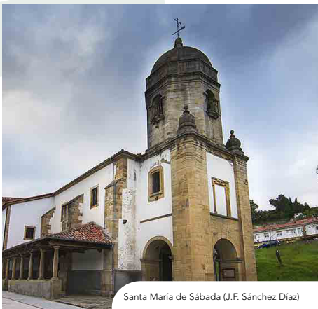
Santa María de Sábada (J.F. Sánchez Díaz)

It was built at the expense of the Robledo family as defence against the British in 1715, equipping it with six powerful cannons . Once it fell into disuse, it was abandoned and, at the beginning of the twentieth century, the big ashlar stones were plundered and brought to the streets of Llastres in order to build the steps of the current stairs. The cannons were used on the reconstruction of the old port, placing them vertically for ship mooring. Two of them were recovered after the expansion of the new port and are displayed with restored wooden carriages, like they had been back in the day.