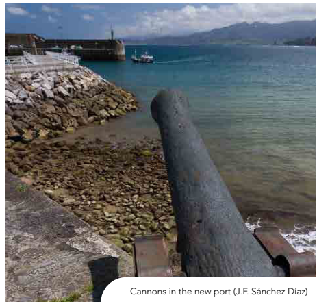
Cannons in the new port