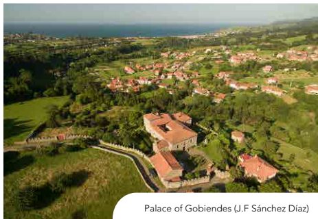
Palace of Gobiendes

We will then leave the interpretation centre on our left and, through a wide path, we will get to the Gobiendes palace whilst we enjoy the surroundings and beautiful sights to the Cantabrian coast and the Sueve. From this point we will descend through the steep Altu del Caleyón to the Espasa River, which we will cross to reach Loroñe through the Ermita neighbourhood.