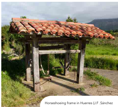
Horseshoeing frame in Huerres

right, until its end, next to the chapel. Now we need to take the wide path of Caleya de la Miyar on our left, and start descending slightly between the houses of La Riestra. Soon, we will see on our left a fountain and a washing place. Looking downwards we can see in the background the Colunga estuary and the Santianes football pitch. A short descent through the woods will take us next to the estuary, where we will continue walking between meadows and mountains on the river's right bank. We will then reach the place formerly known as el Pozo de Los Cámbaros, next to the bridge and the access point to La Griega beach . This is also the starting point of the Dinosaur Tracks Route.