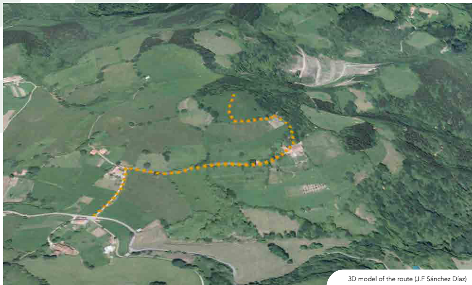
3D model of the route (J.F Sánchez Díaz)

Here we can already see the trail ascending to the spot known as Cueto La Cotariella (484m high), which we can reach in 15 minutes. It is clearly identifiable by a cross placed at its highest point, from where we can enjoy an excellent view.